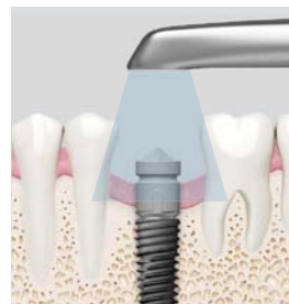
Ti Link + Scan Body